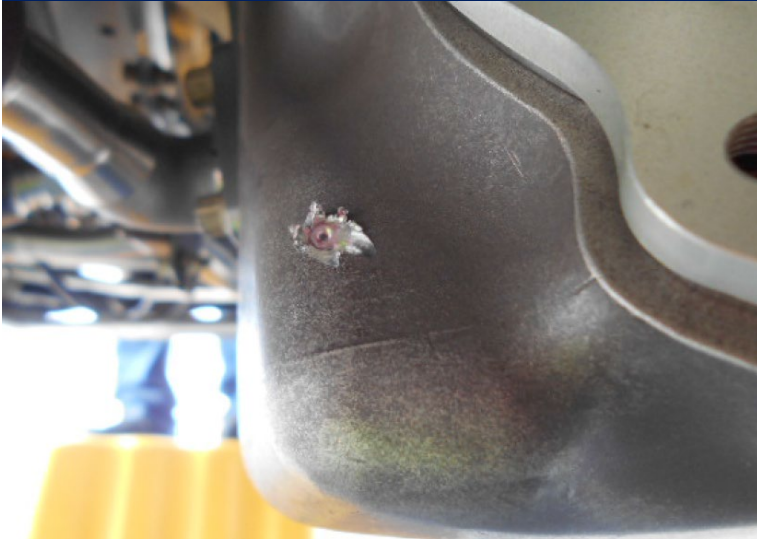
Gouge Damage on TGB (Original Pin)