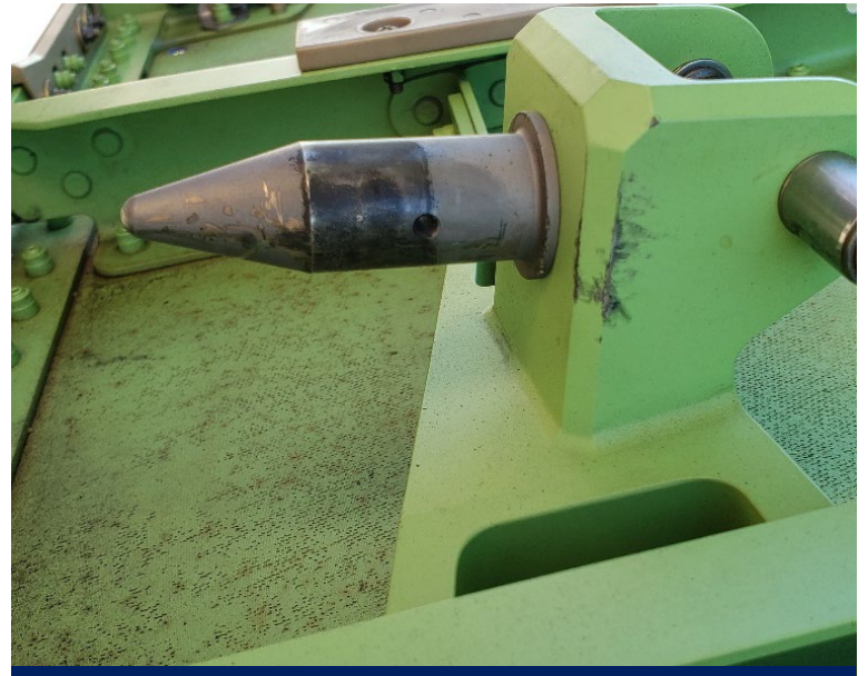
Redesigned Radial Restraint Pin