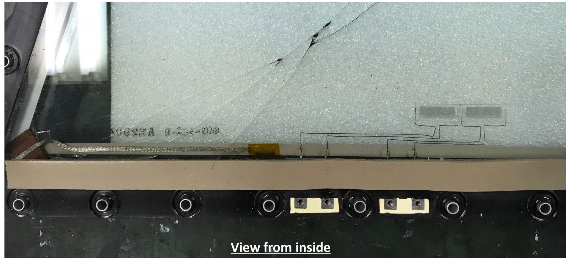
View from inside

No damage was found on the Braid wire, Solder joint and Sensors line on lower side Bas bar.