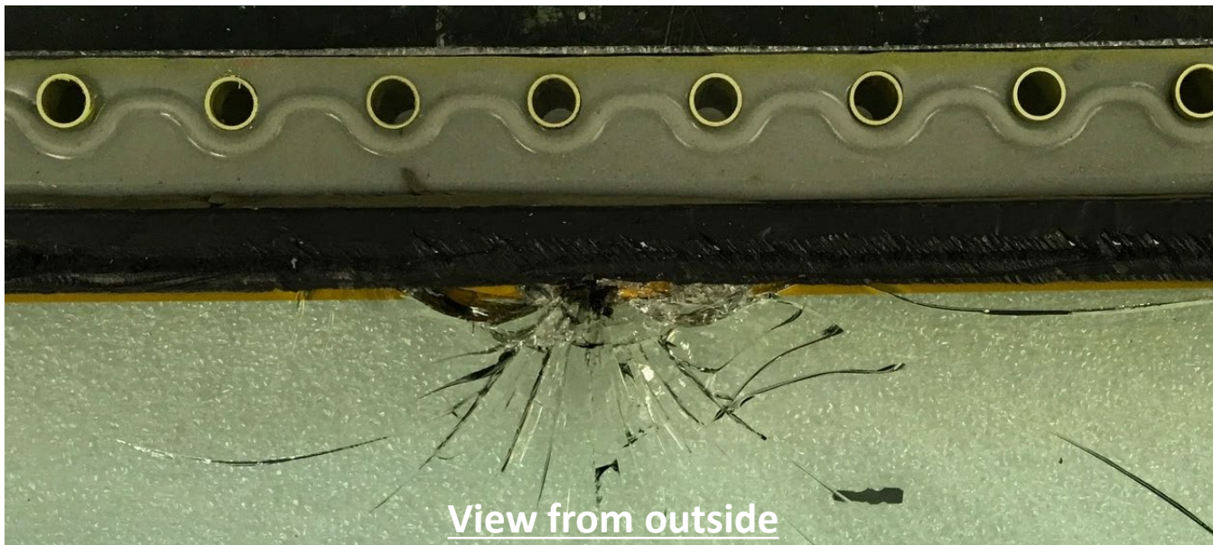
View from outside