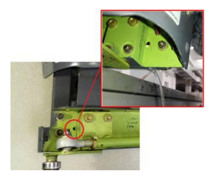
Clean Drain Holes in Window Frame Assembly: