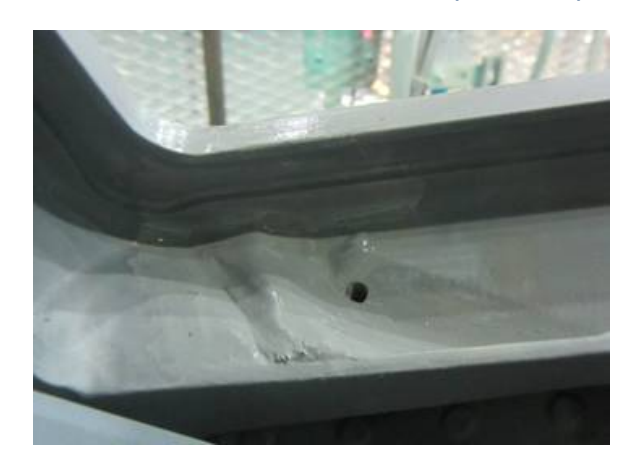
Clean Drain Holes in Window Sill (Structure):