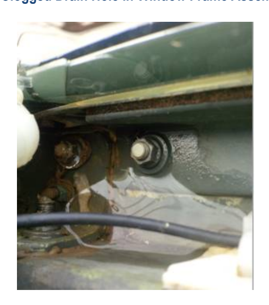
Clogged Drain Hole In Window Frame Assembly: